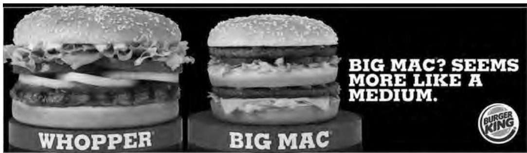
Figure 1 https://neilpatel.com/blog

Use the picture below and answer Questions 6 and 7.