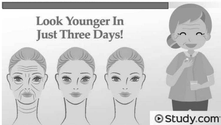
Figure 1: https://study.com

Use the illustration below and answer Questions 6 and 7.