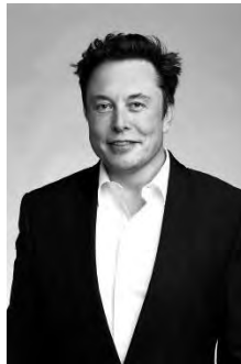
Figure 1: https://en.wikipedia.org/wiki/